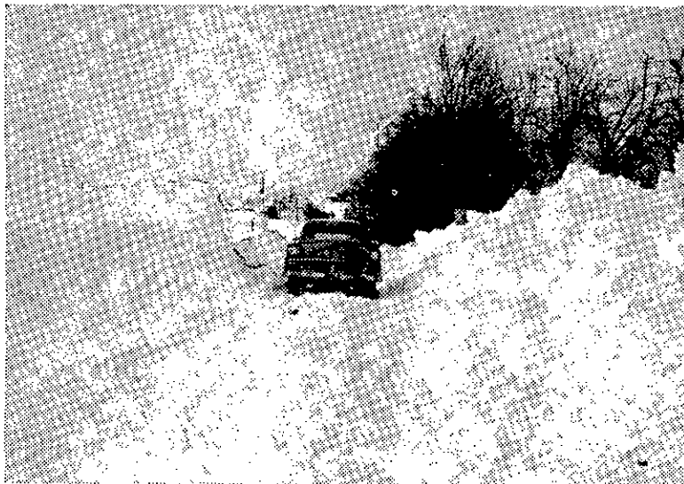
Another drift on the same road, a typical scene all over this area.

Thursday night and Friday brisk winds took a relatively small six-inch snowfall and plugged nearly every road — state, county, and township — in the Utica area. As a result there has been no school since last Thursday, basketball games were postponed, meetings cancelled, and most people have stayed close to home. Because of minor drifting in Utica, village streets had to be plowed only once.